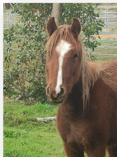
Pictured: Newly arrived Colt Solo