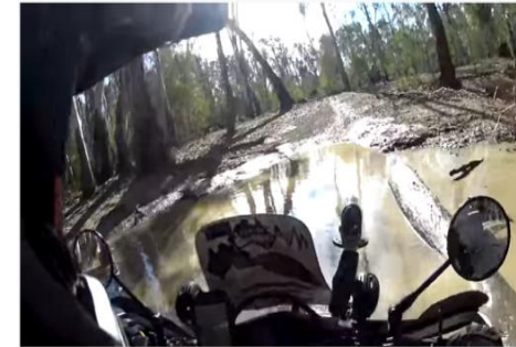
Barmah Motorcycle River Ride - Victoria Australia