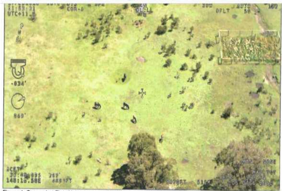
Figure 4. Cowombat Flat, Alpine National Park, 27 February 2020 – Horses grazing near fenced enclosure.

Positive ecological impact is rarely if ever acknowledged because of the strong belief of Australian environmentalists; that since horses are introduced, heavy hard hoofed animals they must only cause damage in Australia (source: ABA).