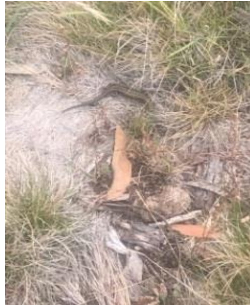
Skinks by Brumby Dung (2018 VicAlps)