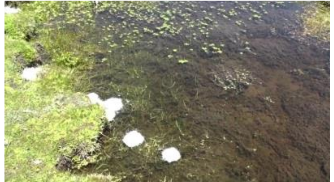
Frogs spawning in hoof prints 2020 in VicAlps

Save energy slashing grass for the Sun Moth - horses will do it for free