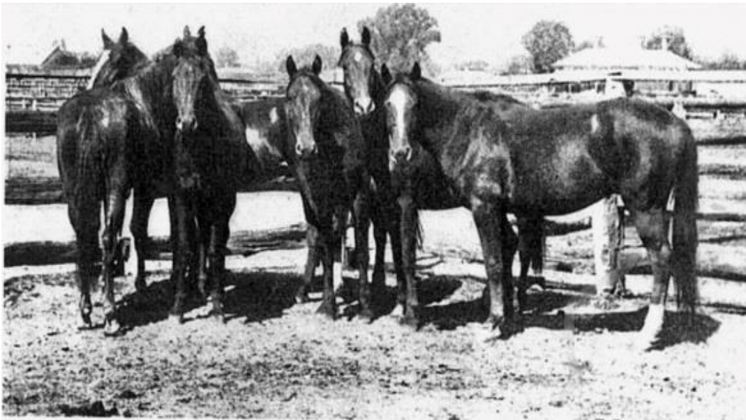
Cabena: Bogong Horses heading to India in Myrtleford sales 1890'S