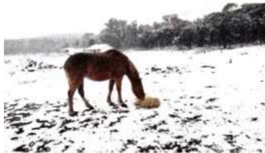
STB Sunshine in the snow

GFNP is a hot spot of sensitivity in relation to the environment and unlike KNP there is little hope of maintaining small numbers of horses under protection. Shameful, when these horses are direct descendants of the Walers, our gallant war horses and our nation's Heritage.