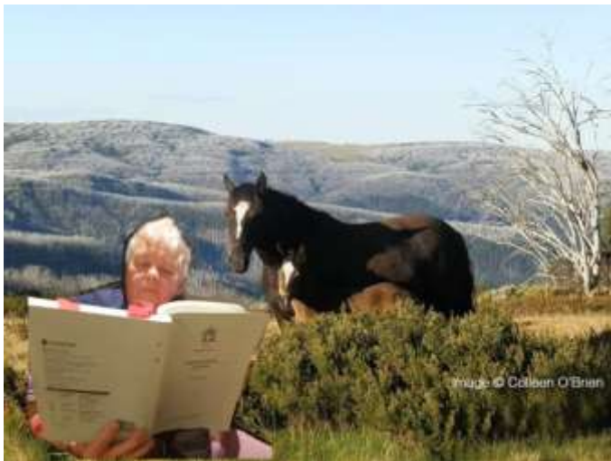
Healthy Bogong Brumbies in their healthy environment, pondering PV’s Act with me.

On Monday 15 July 2019 we finally began our “day in court” against PV. The ABA legal team presented sound legal arguments, which PV’s legal team tried to undermine. Channel 7’s Sunrise program aired good coverage at the start of day 1 which was organised by our media team Six O’clock, despite the usual negative comments from other perspectives.