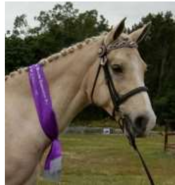
Baroque & Distinctive Breeds show - ABHR Champion Led Brumby - STB Beauté

Increasingly, show committees are adding ABHR sponsored classes to their schedules, including the Baroque & Distinctive Breeds show in Queensland recently where breeds from around the world were showcased.