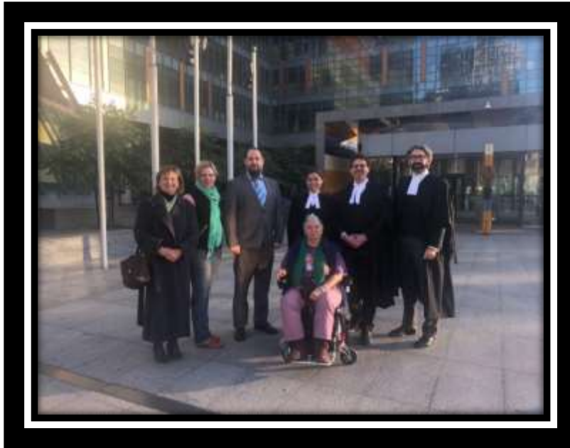
ABA legal team with Friday's ABA supporters