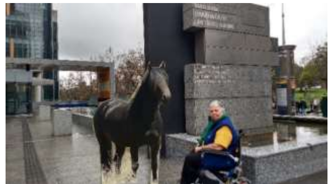
No, Your Honour, I did not trample all the grass and compact the land here, that was from humans.

While our heritage expert gave credible evidence, it depends on how the Judge views all the evidence presented in relation to the EPBC Act.