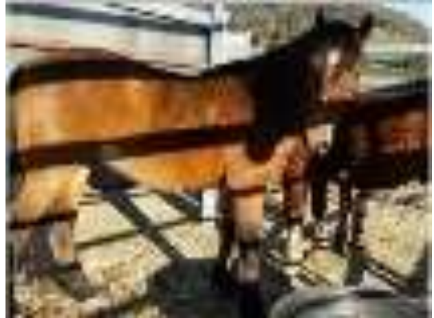
VBA Maximus not long after capture

You can read more about the Australian Brumby Challenge on our website: www.australianbrumbychallenge.com.au or on the Facebook page.