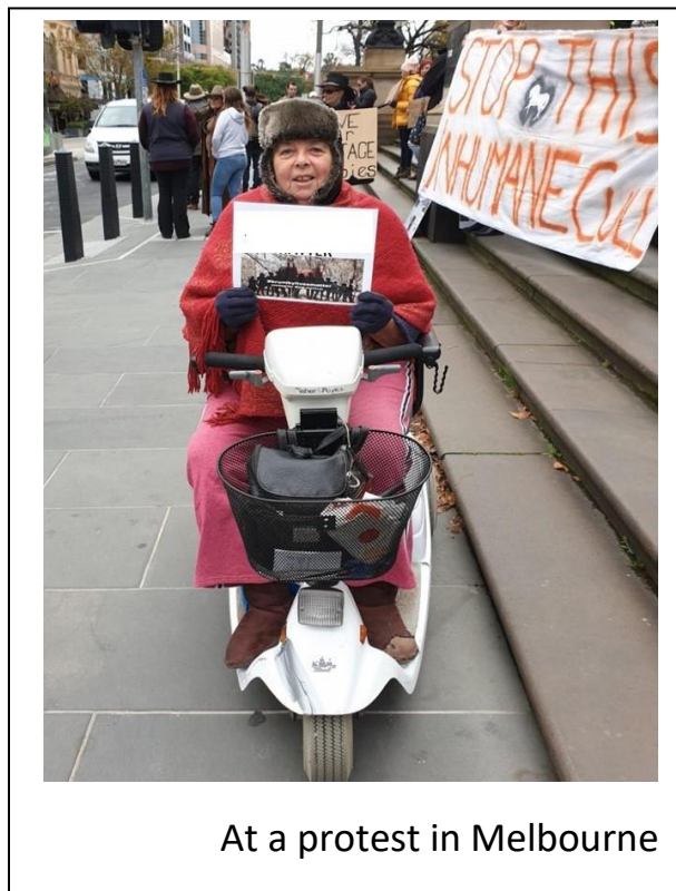
At a protest in Melbourne